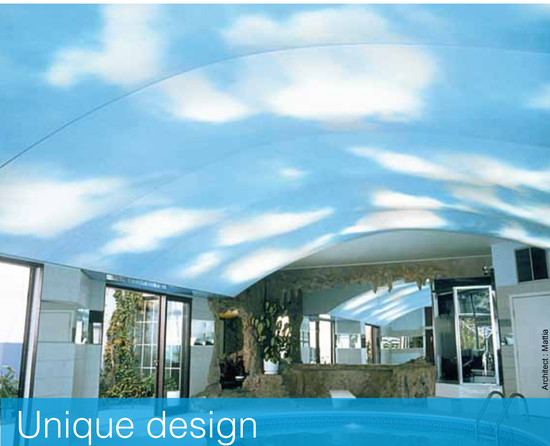
Architect : Mattia