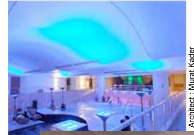
Architect : Murat Kader

Dare to create a 3D ceiling to enhance the design of your swimming pool and admire an original, surprising and unique design.