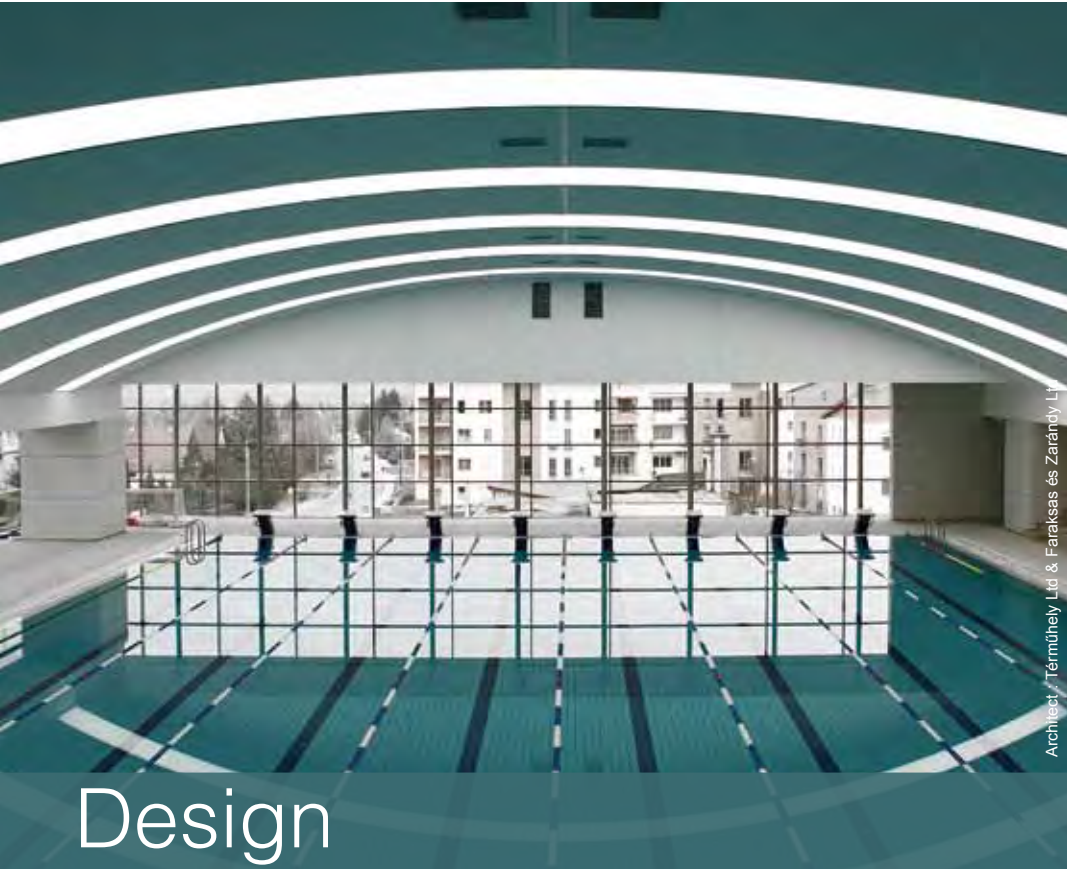
Architect: Térműhely Ltd & Faraksas és Zarándy Ltd