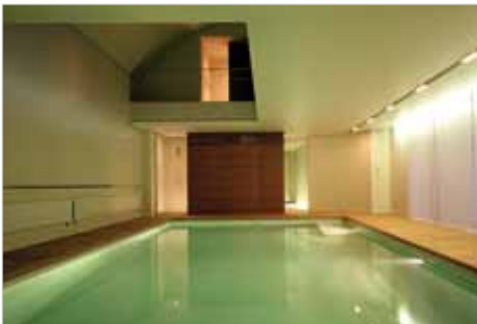
design : P & E Interiors