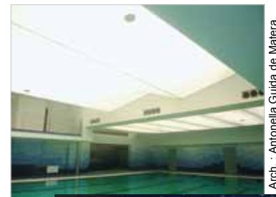
Arch. : Antonella Guida de Matera

Embedded spotlights, optic fibers, luminous ceilings with dimmable and changing colors, choose your lighting solution to create your own space of well-being and relaxation.