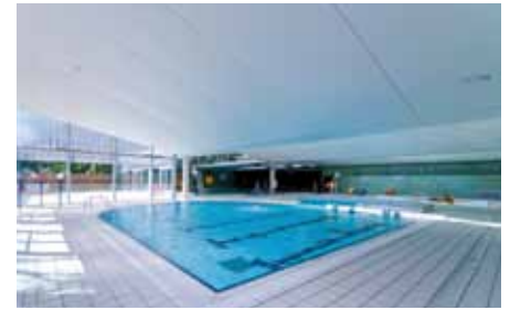
Architect : Atelier Po&Po

With the Acoustics® line , Barrisol® provides solutions to efficiently resolve acoustic problems in public and private swimming pools.