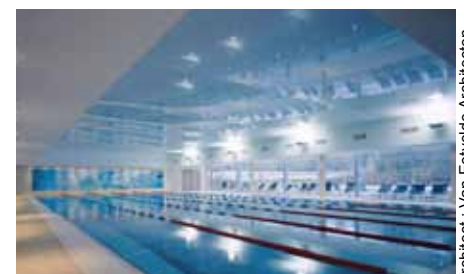
Architect: Van Eetvelde Architecten

For your security, Barrisol® meets or exceeds the fire classification M1 (bs2d0 in Europe), the Euroclasses, the CE marking "Conformité Européenne", Class A, etc. and is UL Classified.