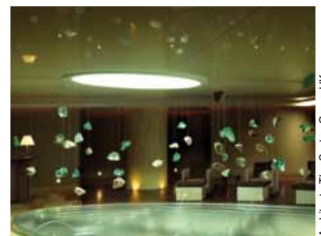
Architect : The Syntax Group UK

With Printed Barrisol® , plunge into another universe! Create your own decoration thanks to digital printing on Barrisol® sheets. It is possible to reproduce all photos, patterns or decors of your choice for a totally personalized atmosphere. Your printed ceiling can be combined with Barrisol® Lighting solutions to create an unique backlit atmosphere. With Printed Barrisol®, the only limit is your imagination!