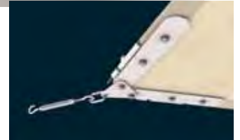
Barrisol® Trempo® by springs