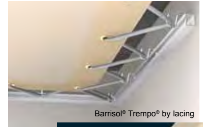
Barrisol® Trempo® by lacing

To answer every decorative ideas, all the Barrisol® sheet can be stretched with the Trempo® system.