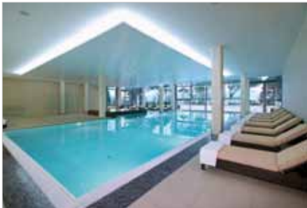
design : Timbextex