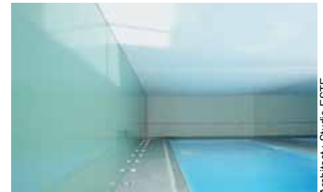
Architect: Studio ESTE

Due to its unique composition, the Barrisol® sheet can be used in humid spaces. Barrisol® solutions are ideal to decorate and renovate public or private spaces.