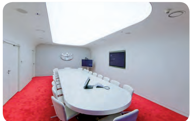
arch. : Ora Ito